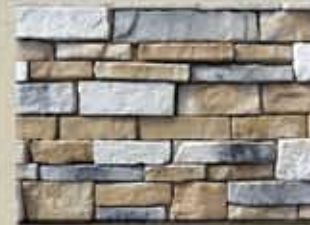
SUNSET MIST Stackstone