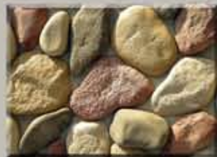
ADOBE River Rock