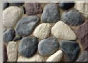
LAKESHORE River Rock