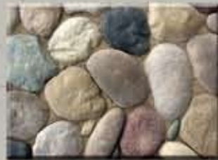
CHAVEZ River Rock