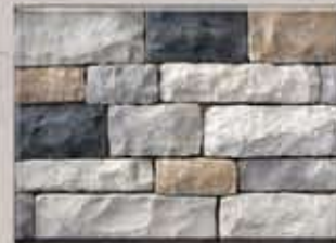
SMOKE GREY Limestone