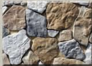
SUNSET MYST Fieldstone