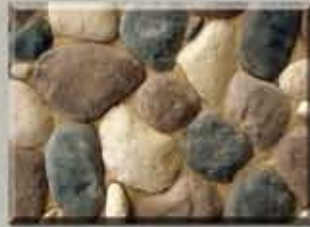
COTTAGE GROVE River Rock