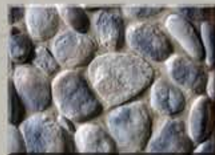
STERLING River Rock