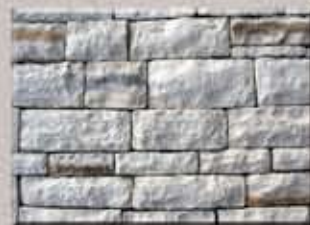
ASPEN CREAM Limestone