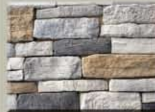
SMOKE GREY Weatherface