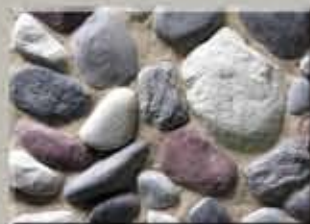
CEDAR CREEK River Rock